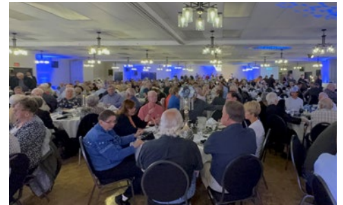
Photos from the 2024 Annual General Meeting.